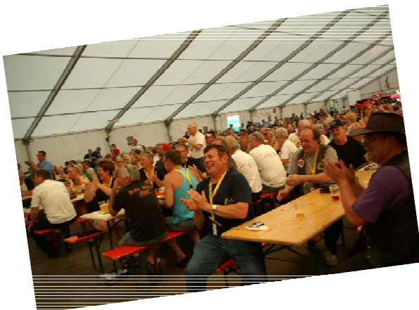
A happy crowd!

This is the first time in the rally's 65 year history that a fashion show has been presented. By all accounts from the models and the audience, it was a lot of fun and a great success!